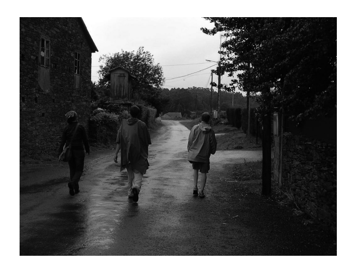
Figure 1: University of Utah graduate students walking the Camino de Santiago in Galicia (Spain). This experience was part of an architecture design studio focused on pilgrimage that I led in Fall 2004.

Developing and leading a pilgrimage-driven course are not usual educational tasks. It should be apparent from the discussion thus far that there is a lot more at stake. We are talking of putting the pilgrim-learners in challenging conditions that by necessity (otherwise there wouldn't be a pilgrimage) defy their existing manners to deal with reality. This may cause unexpected (internal and external) reactions that the faculty must be monitoring and prepared for. As important, the teacher should be also very aware of the places and people the pilgrim-learners will be encountering and how such meetings may affect the local people and conditions. There is no space in this paper to dive into these serious educational, psychological, ethical, social, racial, political, etc. considerations but they are far from trivial. For this reason, good intentions, belief, educational theory, or many years of teaching are not sufficient to embark in a pilgrimage-centered teaching effort. The individual(s) leading the effort must have gone through at least one committed pilgrimage themselves. I speak from experience. It is because I have undergone long (eight to twelve-weeks long) spiritual/cultural pilgrimages in my life [1] that I have been able to successfully lead this type of learning experience for graduate students, scholars, and professionals, including one that followed the renowned Camino de Santiago in Spain (Saint James' way) — see Figures 1 and 2.