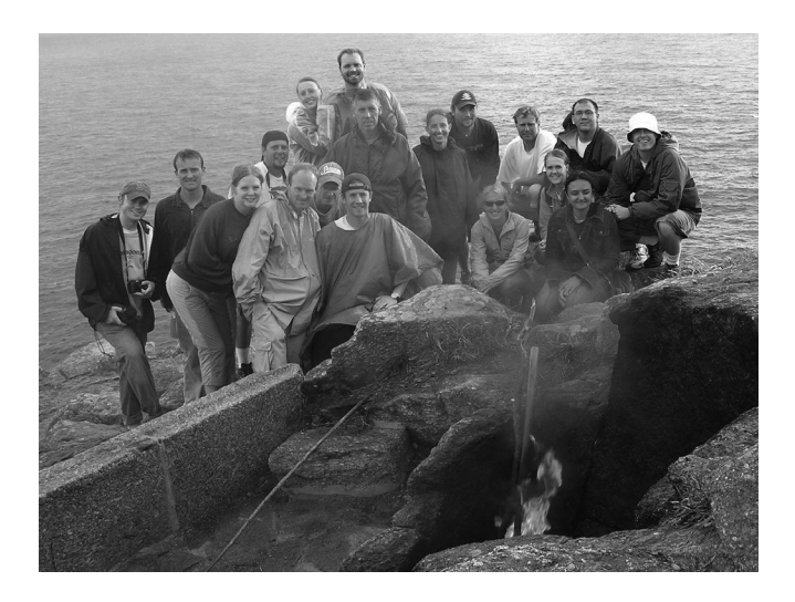
Figure 2: Group photo of the graduate studio at Cabo Finisterre (from Latin, the end of earth), the termination of the Camino de Santiago according to pre-Christian traditions. The Christian end is the Santiago de Compostela Cathedral, 55 miles East (Fall 2004).

Figure 1: University of Utah graduate students walking the Camino de Santiago in Galicia (Spain). This experience was part of an architecture design studio focused on pilgrimage that I led in Fall 2004.